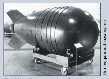
The Mk-6 (pictured above) was the first nuclear weapon to be produced in quantity after World War II with about 1,100 bombs entering the stockpile between 1951 and 1954. The Mk-6 was phased out between 1957 and 1961.

By the 1970s, the military's enthusiasm for nuclear weaponry began to wane, and the decade saw the overall stockpile decline by almost 20 percent due to the phaseout of several nuclear missions. Qualitative improvements, such as placement of multiple war-